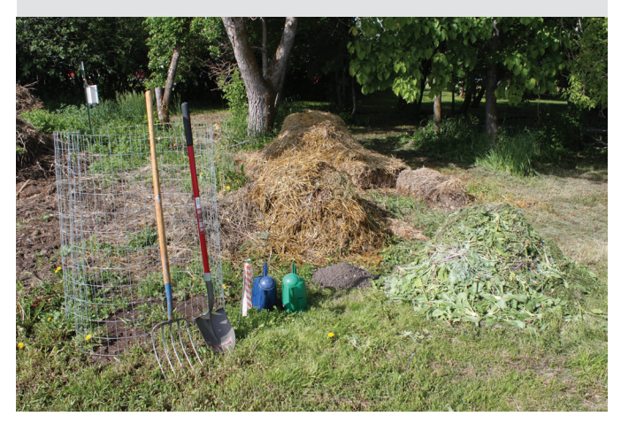
FIGURE 1. The wire bin is constructed from an elevenfoot section of four-foot tall fencing, which gives a volume slightly larger than one cubic yard. Inputs include straw (brown), grass clippings and garden debris (greens), topsoil, and water. A pitchfork makes material handling easy.

they affect the composting process or the final product. Although meat scraps, bones and cheese are composted commercially, they can be slow to degrade and can attract animal pests. Dog, cat, and other carnivore manure may contain parasites that escape destruction in the composting process and should be avoided, especially if the compost will be used on vegetable crops. Don't add cooking oil, oily salad residues or grease, as they can coat materials in the pile and slow the degradation process. Do not use grass and plant clippings sprayed with herbicides or other chemicals to avoid persistence problems and negative effects on microorganisms. Don't use diseased plant material in order to prevent recurrence of diseases. Some thorny materials like rose clippings may make the compost uncomfortable to work with. Although the interior of a hot compost pile can kill most weed seeds, some seeds are heat resistant or may not get thoroughly heated. Therefore, compost nuisance weeds before their seeds mature, or keep them separate from compost that will be used in the garden. Rhizomatous weeds such as morning glory or quackgrass may also survive a pile that doesn't heat adequately.