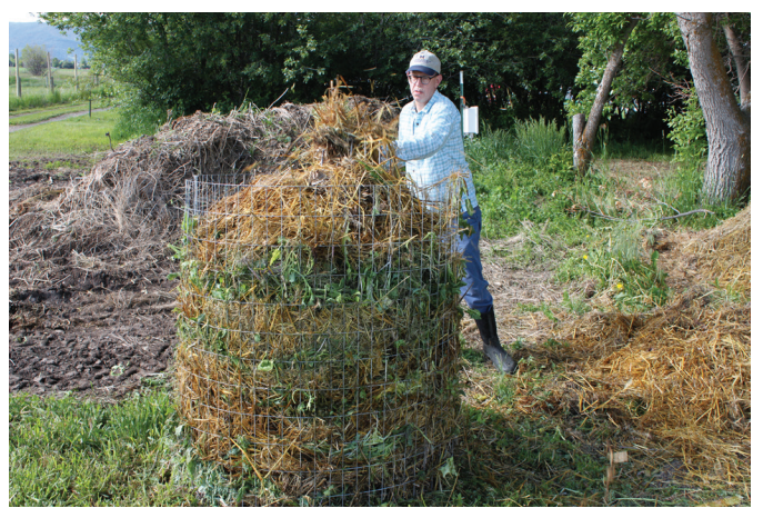
FIGURE 11. The final layer should be straw, which will insulate the pile and hold the heat in.

The final product will be a dark brown material, and the pile will have cooled to air temperature. Unfinished clumps can be separated by screening, with the clumps going into a new pile. An initial application of one to two inches of compost to flower and vegetable gardens beds can be incorporated with a rototiller into the top six inches of soil and will improve the tilth of garden soil. During subsequent years, a half inch of compost raked into the top two inches will help maintain soil tilth. While compost contains some plant nutrients, it is not a replacement for fertilizer. Periodic soil testing with either a home test kit or commercial laboratory is necessary for determining proper nutrient levels for optimum garden performance. See the 'Home Garden Soil Testing and Fertilizer Guidelines' MontGuide for details on soil testing and garden soil fertility management (https://store.msuextension.org/ Products/Home-Garden-Soil-Testing-and-Fertilizer-Guidelines__MT200705AG.aspx). Small amounts of finished compost can be added any time to gardens if you take care to prevent damage to roots while digging and only work it in to the top inch of soil, or use it as mulch. Some composting gardeners make a compost tea by placing compost in a burlap sack and soaking in a barrel of water. This nutrient-rich