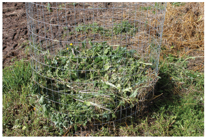
FIGURE 7. Second layer, greens. Grass clippings, weeds and garden debris make up the greens layer for this pile. Manure is not required but is an excellent source of nitrogen.