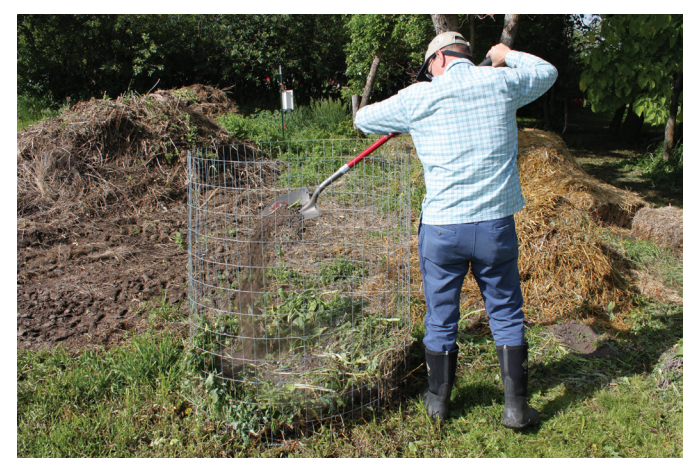
FIGURE 9. A shovelful of garden soil acts as a microbe inoculant.

The pile is ready to turn when the internal temperature has been at 140°F for a few days (Figure 10, page 7). A pitchfork is a useful tool for turning the pile (Figure 11, page 7). Make an effort to incorporate the materials from the outside of the pile into the