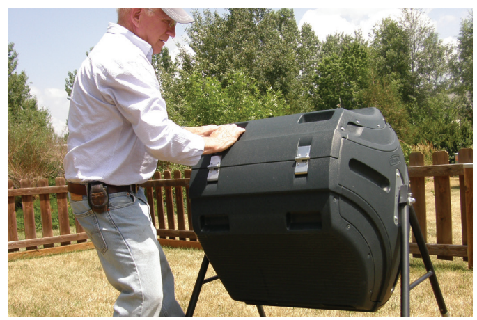
FIGURE 5. Purchased compost tumblers.

turning easier. The main requirements for a container are openings on the sides for air exchange, and easy access for turning the contents.