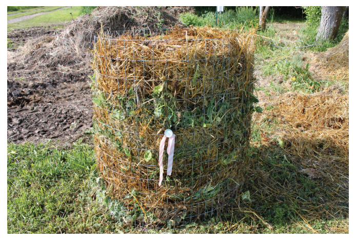
FIGURE 10. A compost thermometer is a nice accessory to determine when to turn the pile.

the pile to microorganisms. A pile can be built on concrete or asphalt if necessary. Any runoff can be collected and used to water plants. Building close to the garden is convenient. Keeping the pile moist is easier if it is built within reach of a hose. Compost piles should not be built near wellhead areas which are sensitive to surface contamination.