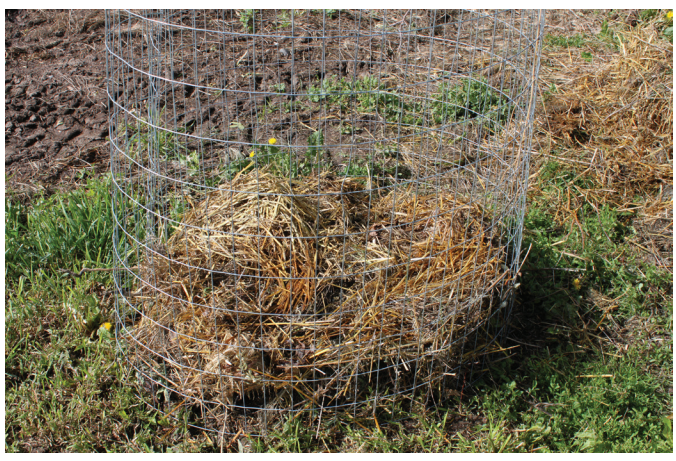
FIGURE 6. First layer, browns. Start with coarse materials to facilitate drainage of excess water.