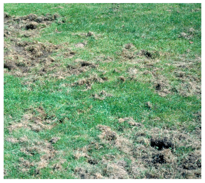
Figure 7: Turfgrass damage from Japanese beetles. BY M.G. KLEIN, USDA AGRICULTURAL RESEARCH SERVICE, BUGWOOD.ORG #0177033

Monitor flower and vegetable gardens for the adults from mid- to late-July. Again, the adults can feed on over 300 different plants but they prefer grape, cherry, apple, rose, raspberry and linden. Monitor those plants if you suspect Japanese beetle.