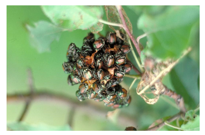
Figure 5: Aggregation of Japanese beetle adults.

Adult Japanese beetles feed on foliage, flowers, and fruits of several plant species. They prefer to feed in groups in direct sunlight ( Figure 5 ) and usually start at the top of a plant. Leaves take on a skeletonized appearance as tissue is eaten from between leaf veins ( Figure 6 ). Adult beetles will begin feeding on low-growing plants upon emergence, switch to