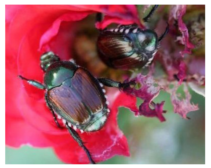
Figure 1: Japanese beetle adults feeding.

The Japanese beetle, Popillia japonica , is a damaging plant pest introduced from Japan into New Jersey in 1916. It has since spread and established in most states east of the Mississippi River. Several partially-established areas and infestations occur west of the Mississippi River, including Montana. Many western states are protected by the National Plant Board Japanese beetle harmonization plan, including Arizona, California, Colorado, Idaho, Montana, Nevada, Oregon, Utah, and Washington. Twenty-eight other states also regulate the Japanese beetle with state-level quarantines.