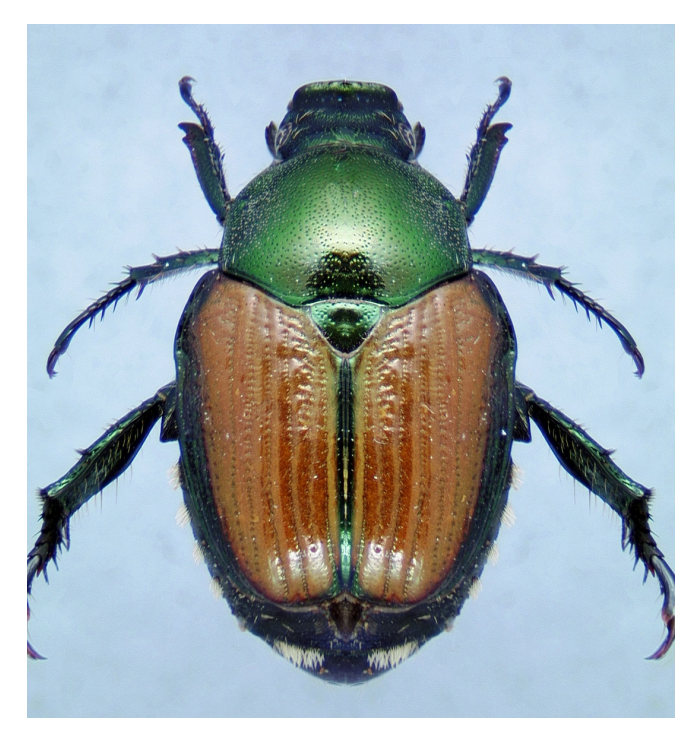
Figure 3: Adult Japanese beetle.

Adult. The adult Japanese beetle is .25–.5 inches (7–12 mm) long and about .25 inches (6 mm) wide, with a metallic green, oval-shaped body with bronzed outer wings (Figure 3). The head and thorax are green and the wing covers are brownish with a green outline. A distinguishing feature of this adult beetle is that it has five small tufts of white hair along the sides of its abdomen and two more patches of hair protruding from the last abdominal segment. The antennae have a club of small plates at the end. These characteristics allow for the differentiation from other similar scarab beetles.