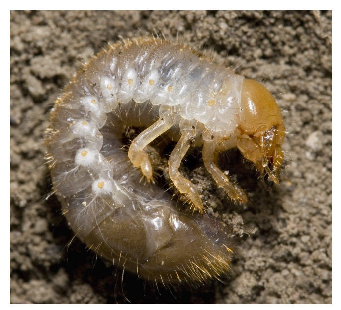
Figure 4: Japanese beetle larva.

of spines on the raster, the underside of the last abdominal segment. This pattern is consistent through all three larval instars. The first instar larva is white but turns a greyish-black when fecal material accumulates in the hindgut.