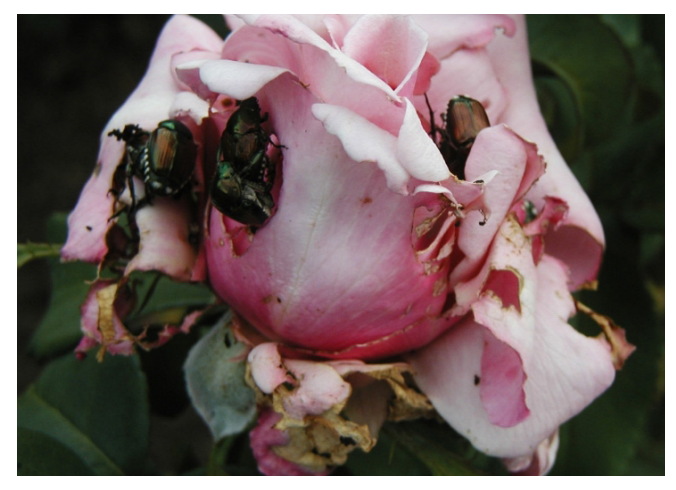
Figure 8: Roses are highly susceptible to Japanese beetle infestation. BY DOW GARDENS, BUGWOOD.ORG UGA5142052