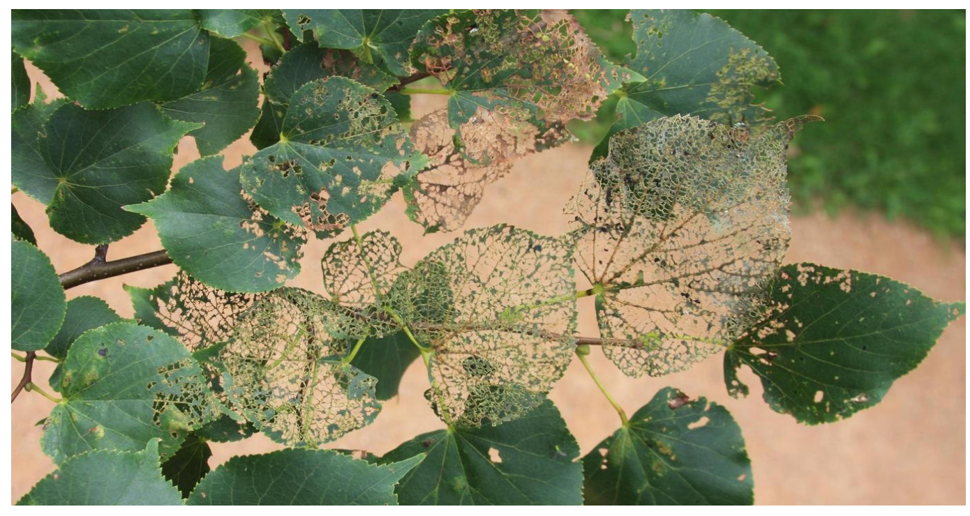
Figure 6: Leaf damage from Japanese beetle.

fruit and shade trees, and will subsequently return to lowgrowing plants. Characteristic damage symptoms include plant yellowing, wilting, and defoliation. In severely damaged areas, plant death can often occur.